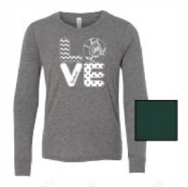
Gray or emerald green tri-bland leng sleeve T-shift with white imprint. Youth, gray enly. Adult, both colors, $18,00.