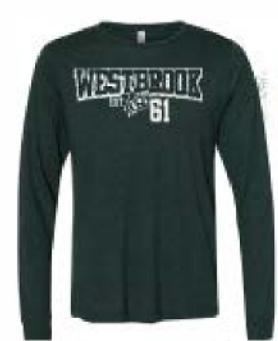
Emerald green or gray tri-blend king sleeve T-shirt with white distressed imprint Youth gray only. Adult, with colors, $18.00