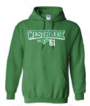
Irish Green hood is with white distressed imprint. Youth and adult sizes, $21.50