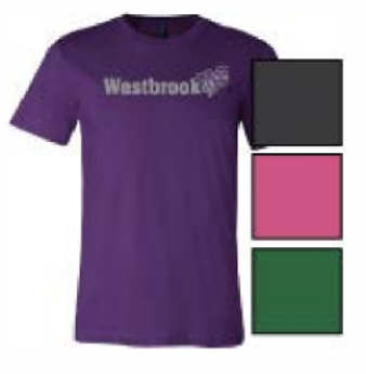
Canvas unisex super soft T-shirt with glitter imprint. Asphalt, berry, kelly green or purple, Youth and adult sizes. $15,00.