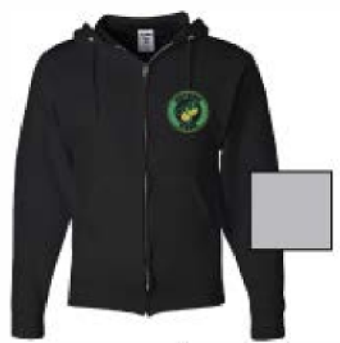
Black or sport gray zip hood is with kelly green and gold imprint Youth and adult sizes. $28,00