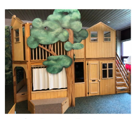
Our Reading Treehouse