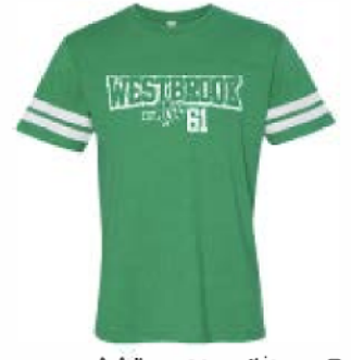
Vintage green/white super soft jersey T-shirt with white distressed imprint. Men's, women's (women's isv-neck) & yeuth $17.00

Questions? Email Karin Petrenko at kgyllstr@hotmail.com