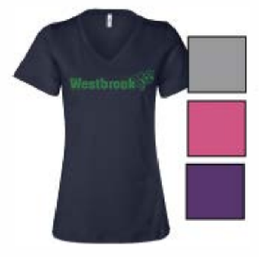
Bella women's einly, super soft vineck T-shilt with glitter imprint, navy, gray tri-blend, berry or purple. $16.50.