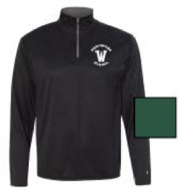
Badger youth, men's and women's black or forest ¼ zip 100% poly bing sleeve shirt with white left crest imprint, $30.00.